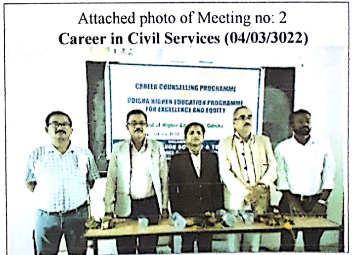
Attached photo of Meeting no: 2 Career in Civil Services (04/03/2022)

Anam 24/05/22 Principal Balimela College, Balimela Principal Balimela College of Sc. & Tech. Balimela